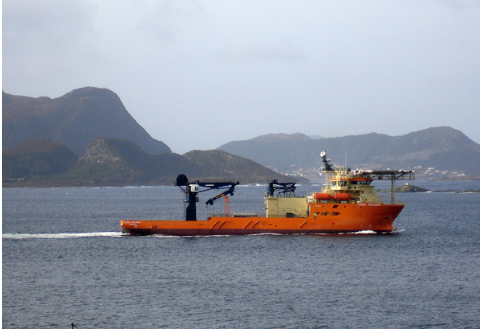
Figure 1-Toisa Paladin Offshore Construction Vessel

14. The Debtors’ well test service vessel, Toisa Pisces, is a highly specialized type of DP vessel – designed and built to receive, process, store and offload hydrocarbons and other products, from drilling rigs or clean-up operations.