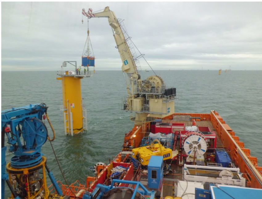
Figure 3-Toisa Warrior ROV Vessel

15. The Debtors' ROV Support Vessels are DP vessels from which ROV (Remote Operating Vehicle) operations are conducted. ROV Support Vessels are equipped with computer-controlled, precision, position-keeping capabilities with added redundancy features, such as multiple computers, thrusters and reference systems. Such vessels have additional cabins, mess room facilities and customer offices, to comfortably accommodate the ROV support crews of the Debtors' customers.