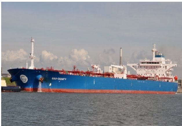
Figure 5 - Tanker United Journey (formerly Gan Dignity)

17. Due to the downturn in the oil market, a number of the Debtors' offshore vessels are currently being held in cold lay-up to reduce costs and maintain the assets and preserve value pending the oil market's return.