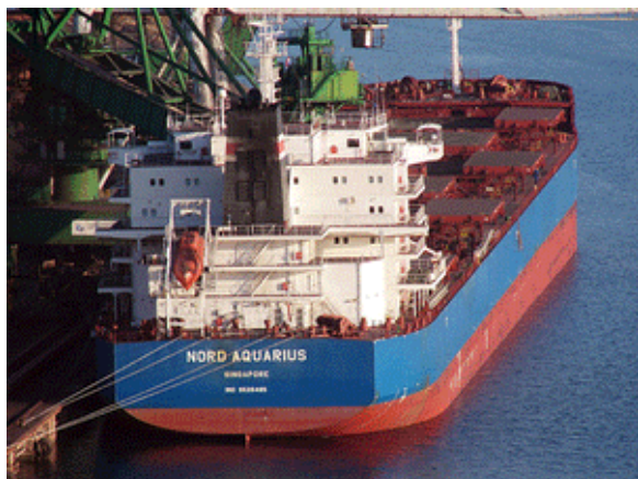
Figure 6 - Bulker Trade Vision (formerly Nord Aquarius)

19. The Debtors’ seven (7) bulkers are all Kamsarmax bulkers capable of carrying approximately 81,000 tons of dry cargo in seven holds/hatches. The Debtors’ bulker fleet is very young with all of the bulkers built since 2011.