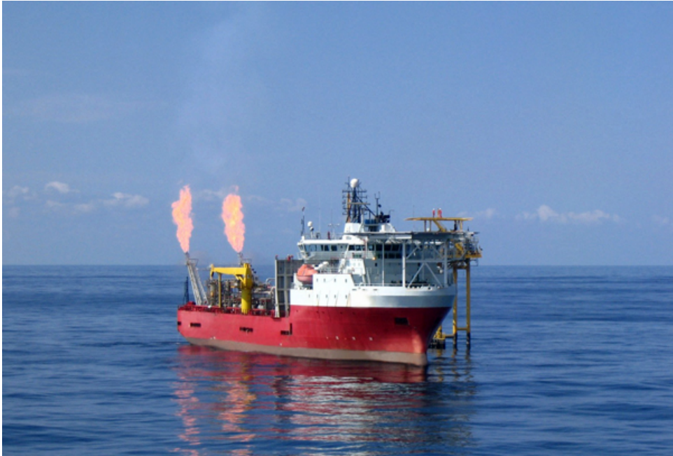
Figure 2-Toisa Pisces - Well Testing Vessel

14. The Debtors’ well test service vessel, Toisa Pisces, is a highly specialized type of DP vessel – designed and built to receive, process, store and offload hydrocarbons and other products, from drilling rigs or clean-up operations.