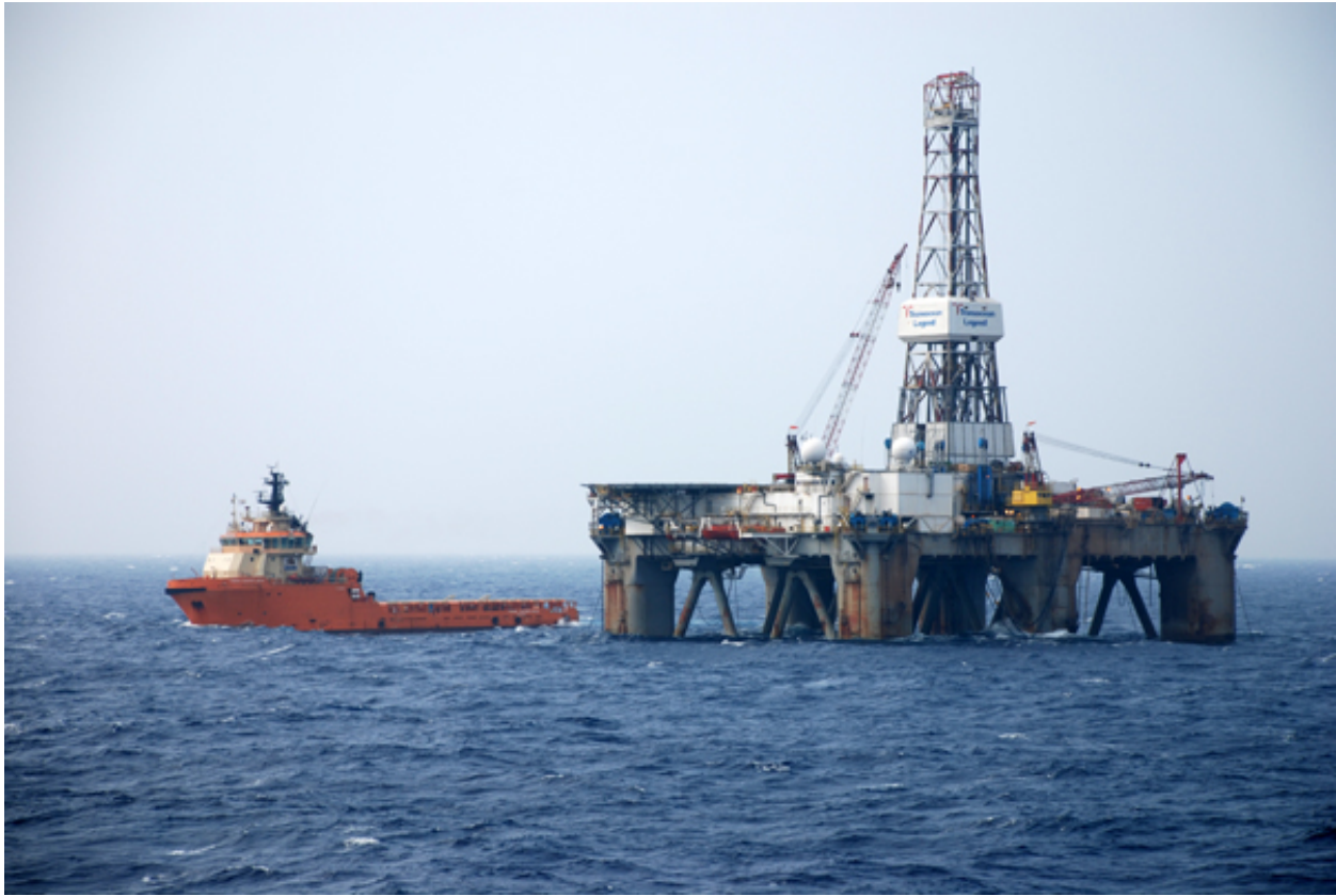
Figure 4-Toisa Dauntless AHTS Vessel

platforms, and for the handling and laying of their anchors. These vessels also have supply duty capabilities.