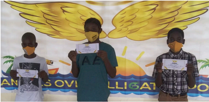
High school freshmen holding their school vouchers in the community of Alligator Pond, Jamaica