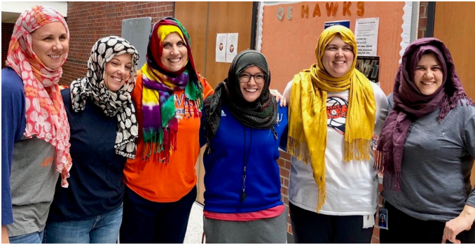
Women from different religious backgrounds participating in World Hijab Day on February 1st.

She had the idea for a designated day annually when women of all faiths would be encouraged to wear the hijab in solidarity with Muslim women worldwide – an opportunity for others to have the visceral experience of head-covering, if only for a day.