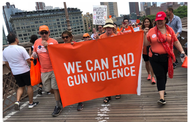
“Youth Over Guns” March across the Brooklyn Bridge (NY) in 2018

“The Foundation is a way of giving back; it’s a vehicle for getting the resources that are missing from the community into the community,” she said.