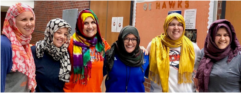
Women from different religious backgrounds participating in World Hijab Day on February 1st.

She had the idea for a designated day annually when women of all faiths would be encouraged to wear the hijab in solidarity with Muslim women worldwide – an opportunity for others to have the visceral experience of head-covering, if only for a day.