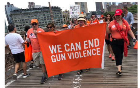
“Youth Over Guns” March across the Brooklyn Bridge (NY) in 2018

“The Foundation is a way of giving back; it’s a vehicle for getting the resources that are missing from the community – into the community,” she said.