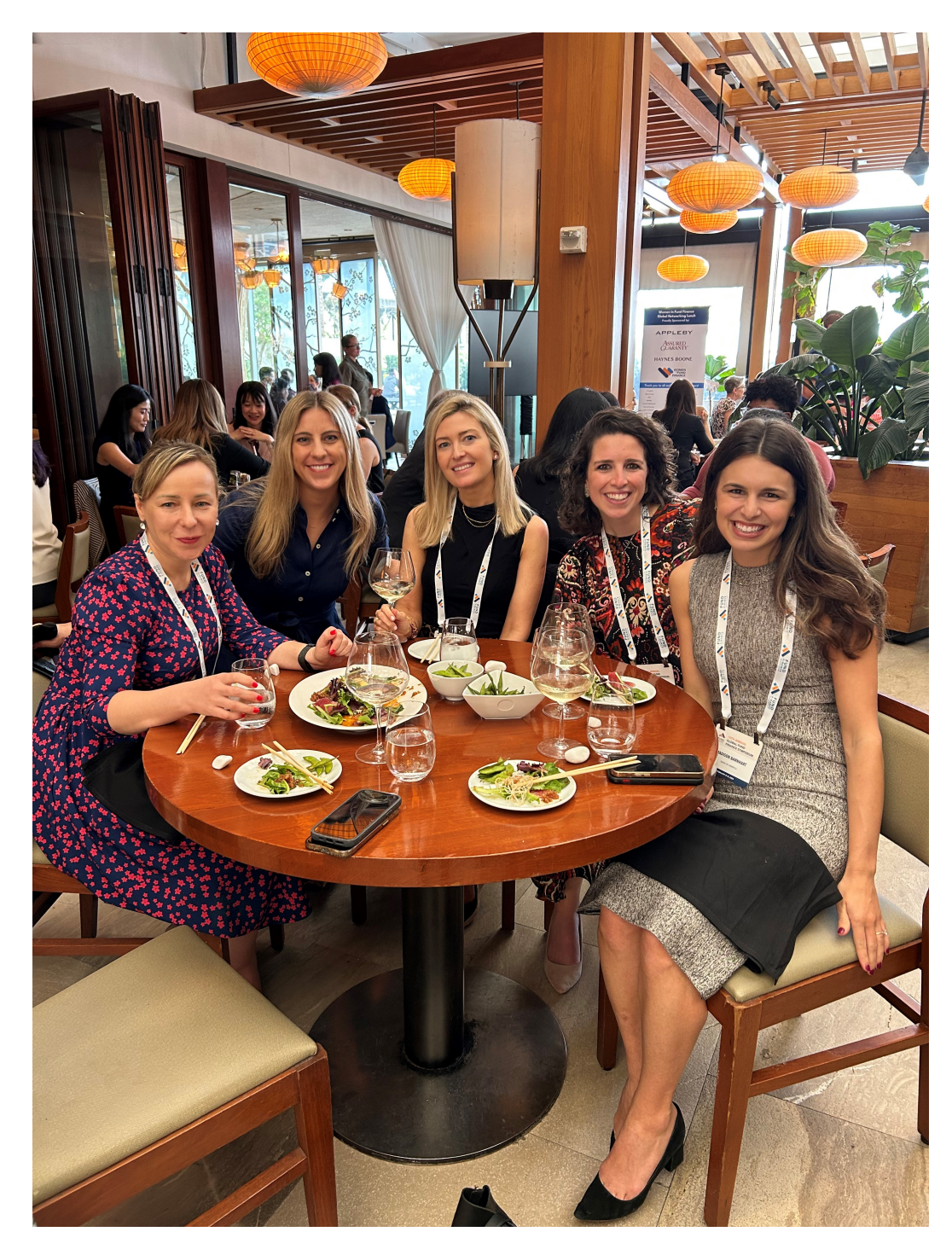
FFA "Women in Fund Finance" (WFF) luncheon