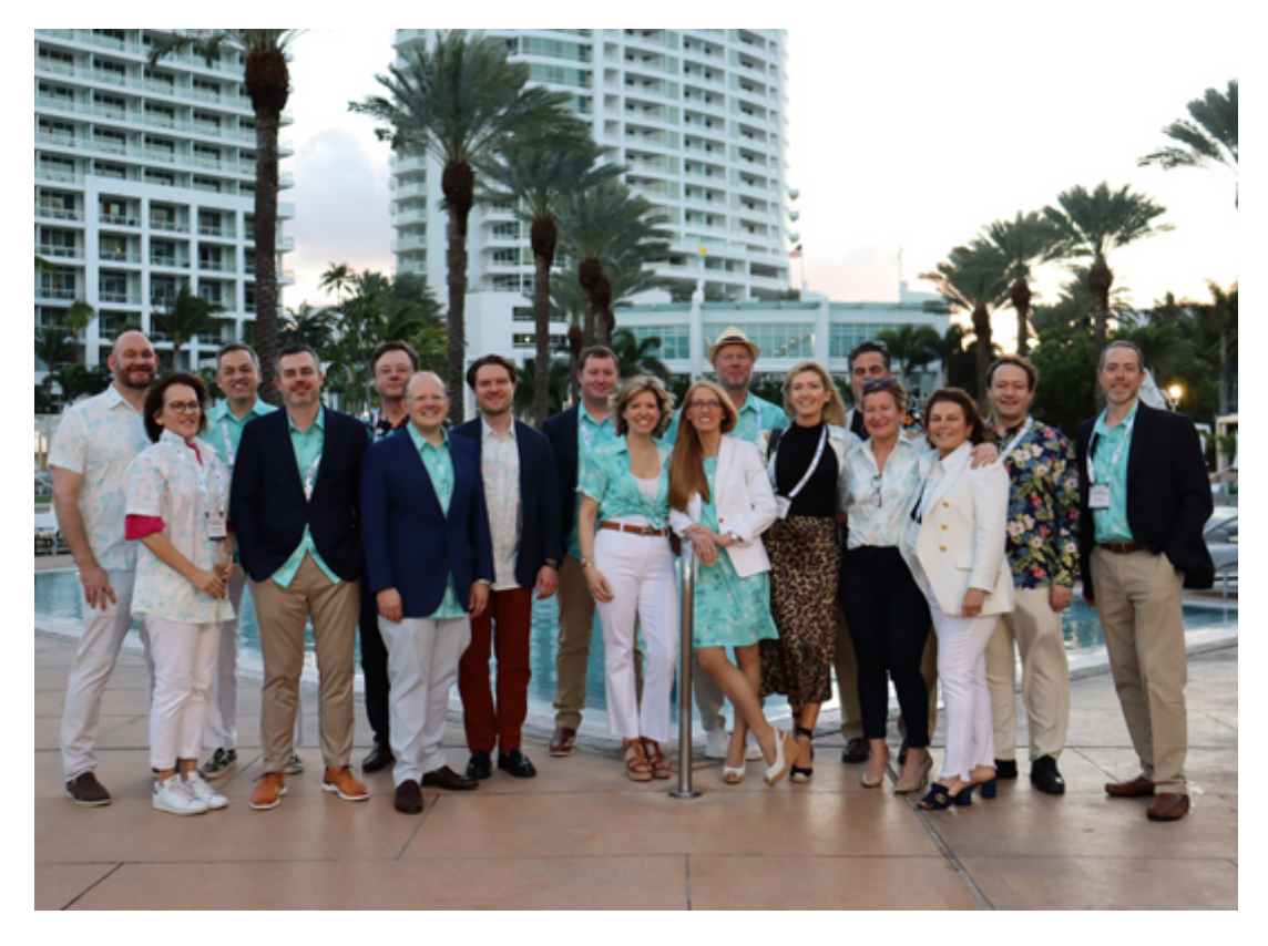
Cadwalader Fund Finance Team at Welcome Night Reception